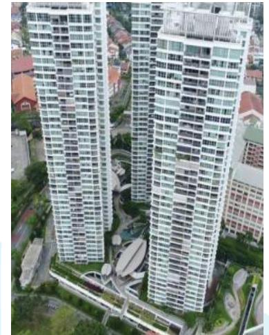
Upcoming Repainting of Blks 273A, 273B & 275A