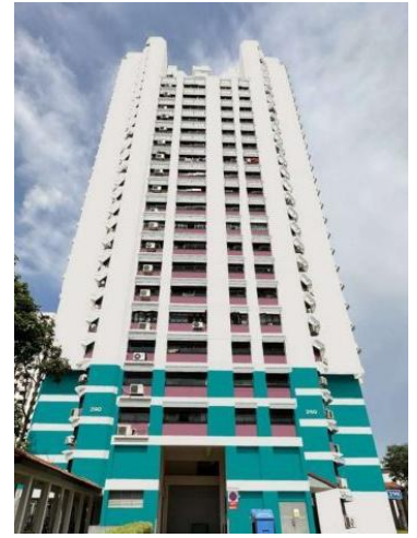
Repainting of Blks 228 to 293 (Completed)