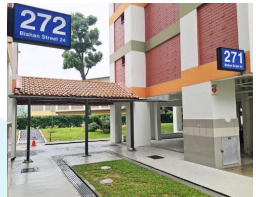
Low Linkway connecting Blk 271 & 272 (1Q 2025)