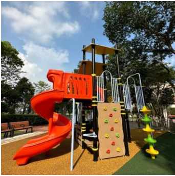
New Playground & Fitness Corner at Blk 293 (Completed)