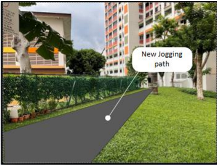
Jogging Path along Blks 271 & 272 (Completed)