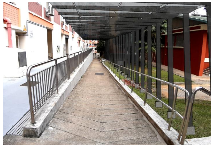
New Shelter over Existing Barrier Free Access Ramp at Blk 267 & 268 (3Q 2025)