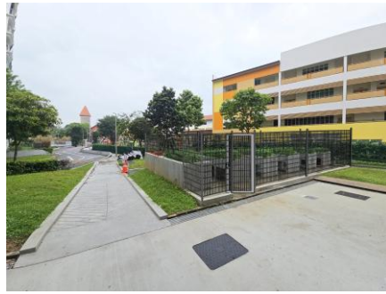
Community Garden & Jogging Path at Blk 272 Bishan St 22 (3Q 2025)