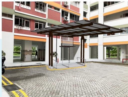
Drop-Off Point at Blk 272 (3Q 2025)