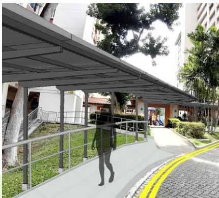
New Widened Footpaths at Blk 267 & 268 (1Q 2025)