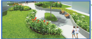
Landscaped Open Space at Blk 211 & 214