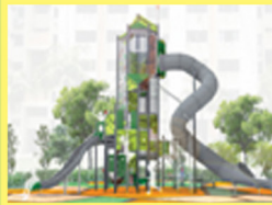
Playground - Blk 287