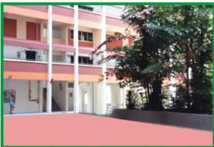
Upgrade Community Spaces Flooring at Blk 261