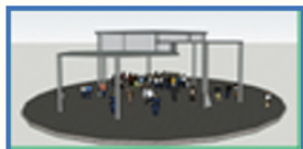
Shelter with Seats at Neighbourhood Park at Blk 287