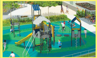
Playground between Blk 204 & 207