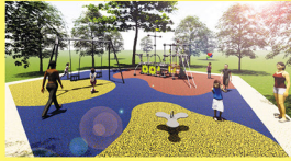
Upgrading of Park and Playground between Blk 243 and 245