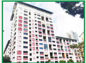
Repainting of Blocks - Blk 201 to 256, 288 to 293