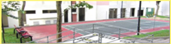
Upgrading of Badminton Court next to Blk 254