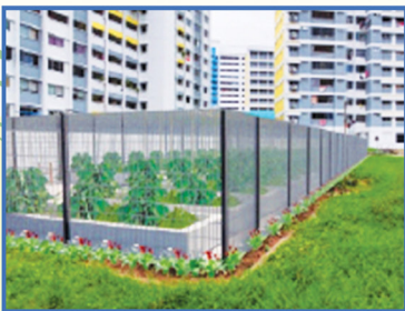
Community Gardens - Blk 241, 271, Neighbourhood Park at Blk 287 & 304