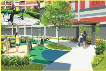
Senior Fitness Stations - Blk 201, 204 & 210