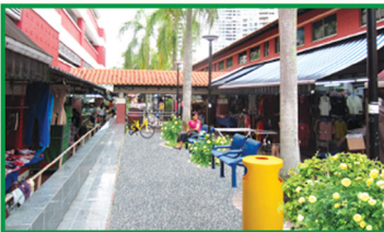
New Landscape and Flooring - Bishan North Shopping Mall