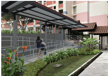
Covered BFA Ramps: Blk 204, 207, 209, 211, 215, 216