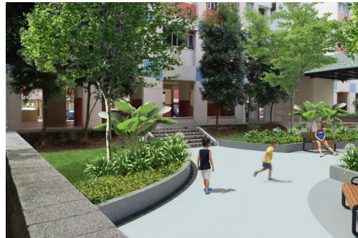
New Landscape Open Spaces: Between Blk 211 to 216, Between Blk 214 and 220