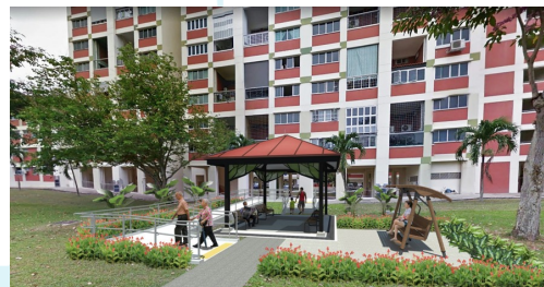
Reconstruction of Park Shelter: Blk 219