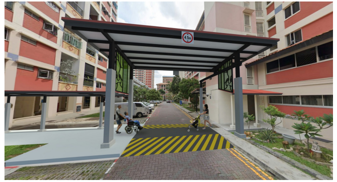
Low and High Linkways: Blk 210, 212, MSCP 212A, 216