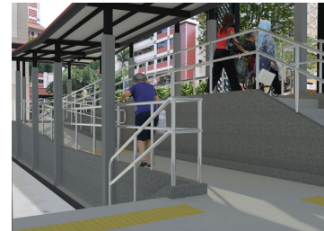
Covered Ramp & Staircase: Connecting to Blk 205