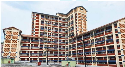
Repainting of Block: Blk 201 to 221