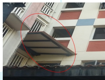
Extended Roof: Blk 210, 215