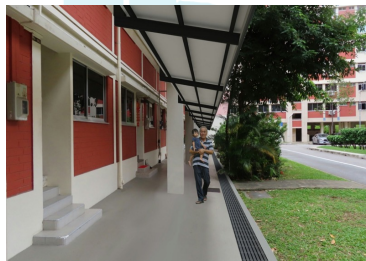
Extending Awning: Blk 208