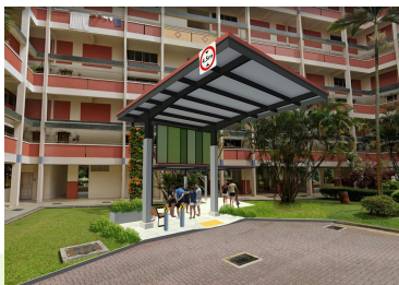
Drop-off Point: Blk 201, between Blk 203 and 204