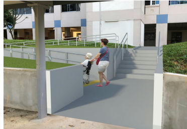
Open BFA Ramp: Blk 203